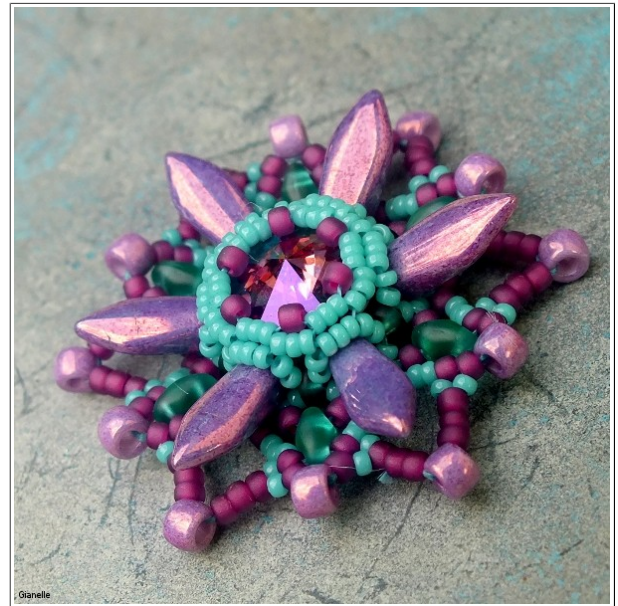
And here I added one more row of netting