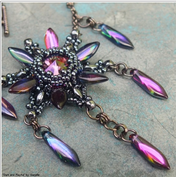
Use a few jump rings, five dagger beads and two pieces of chain to create this fabulous necklace