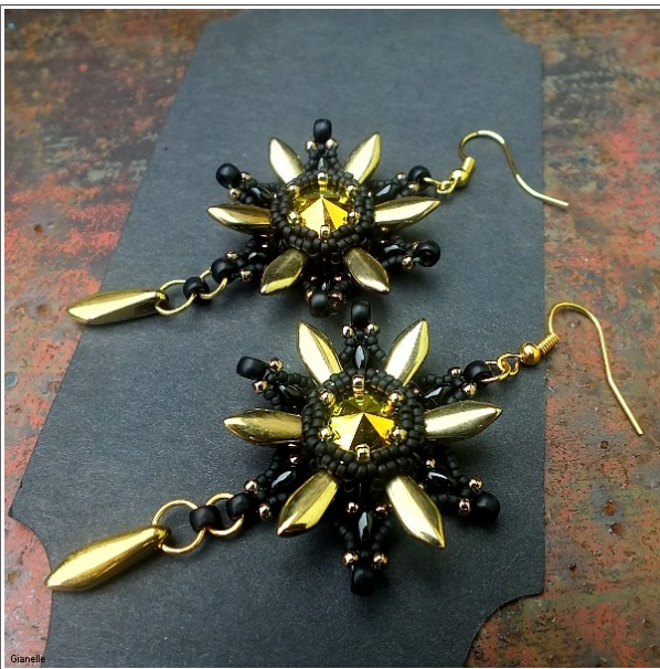
These stars can be used as earrings or pendants.

I used the same kind of embellishment on the gold/black earrings on the left.