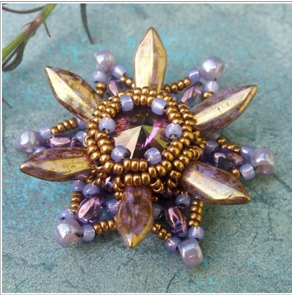
This is how the finished star looks like